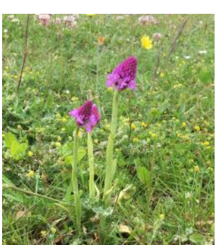
Above: Tiny Pyramidal Orchids on a road verge. Left: Early Purple Orchid.

You can expect to see all of the "Big 8" bumblebees if you're doing a FIT Count in Bucks, but there's also a good range of solitary bee species in the county, so look out for Ashy Mining Bee (Andrena cineraria), Chocolate Mining Bee (Andrena scotica), and Red Mason Bee (Osmia bicornis), among others.