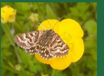
Mother Shipton moth (Callistege mi)