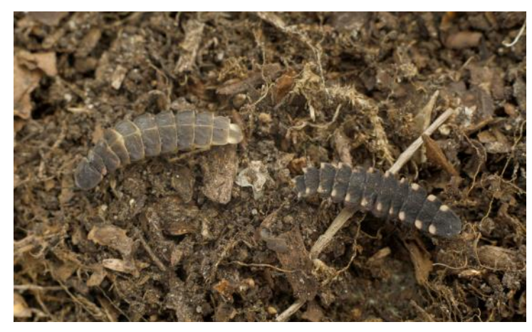
Above: On the left is an adult female glow worm (facing left) and right a larva (facing right).

When the object of her desire arrives she promptly starts to make her way down into her hiding place, carrying him with her, turning off her glow slowly as she does so. This takes a matter of minutes. A day or so after mating she lays her eggs. Neither sex can feed as adults, so she will probably soon die, while the male may have another week or two of life left.